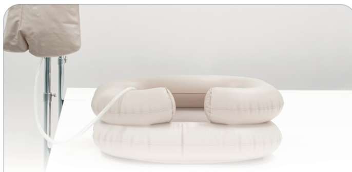
HAIR WASH BASIN