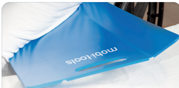
GROOVED BOARD TO ASSIST TRANSFERS